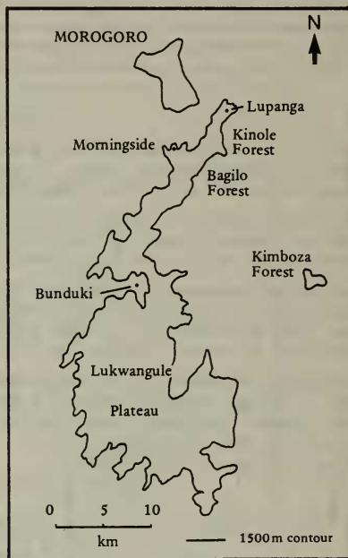
Fig. 3 The Ulugurus

A specimen taken from Mwanihana Forest, 17 Sep 1981 has been described as a new subspecies (Jensen & Stuart, in press). Birds from Mahenge can also be assigned to this new race, but we regard B. o. ulugurensis described by Ripley & Heinrich (1969) as invalid and prefer to treat Uluguru birds as nominate (see Jensen & Stuart, in press).